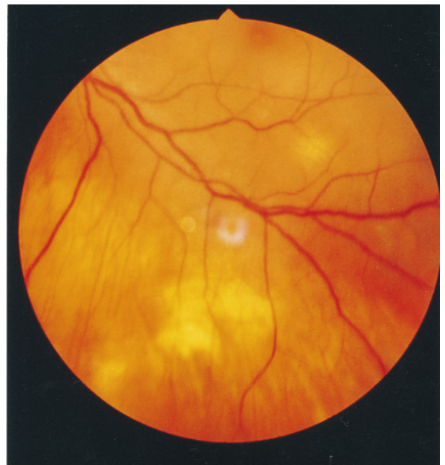
FIGURE 2. (Top) Fundus photograph of the left eye. A round, yellow plaque with regular edges less than 2 disk diameters in the superonasal quadrant is shown. (Bottom) Fundus photograph of the left eye. Plaques in the inferotemporal quadrant.

An adult low-penetrance form of Bartter syndrome was diagnosed in the patient around 1981, based on the findings of hypokalemic alkalosis (serum potassium: 2.3 to 2.8 mmol/l; normal: 3.7 to