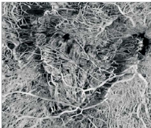
Figure 2. Xephilio A1 OCT angiography shows an intact choroidal graft.

ization (MNV) in the contralateral eye, which is being treated with anti-VEGF injections.